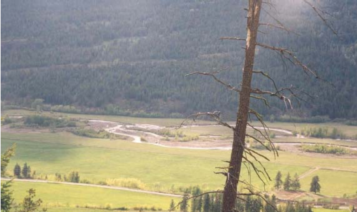
Figure 2: The Coldwater River seen from the Coquihalla Highway. Note the removal of riparian vegetation (Rosenau and Angelo 2003).